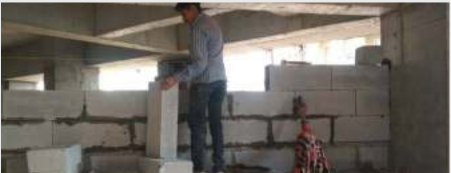
RYAN SCHOOL - 1 ST FLOOR BLOCKWORK IS IN PROGRESS.