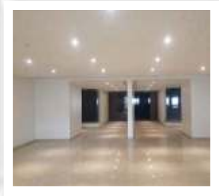
YASHWIN HINJAWADI - 'B' READY FOR POSSESSION.