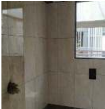
PALLADIO - E - TOILET DADO TILE WORK HAS BEEN COMPLETED UPTO 21 ST FLOOR.