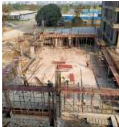
YASHONE MAAN-HINJAWADI - MULTIPURPOSE HALL - TERRACE SLAB COLOUMN SHUTTERING WORK IS IN PROGRESS.