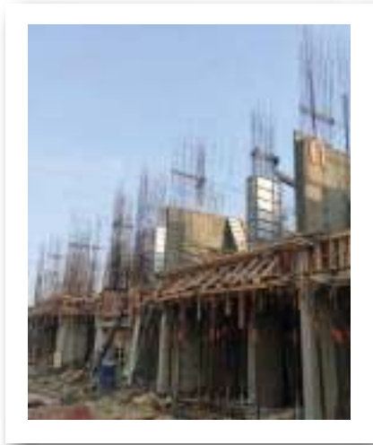
YASHWIN SUKHWIYAS - 'B' - SHEARWALL FOR SECOND FLOOR HAS BEEN 50% COMPLETED.