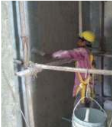
YASHWIN ENCORE - 'A2' LIFT SHAFT WHITE WASH WORK IS IN PROGRESS.