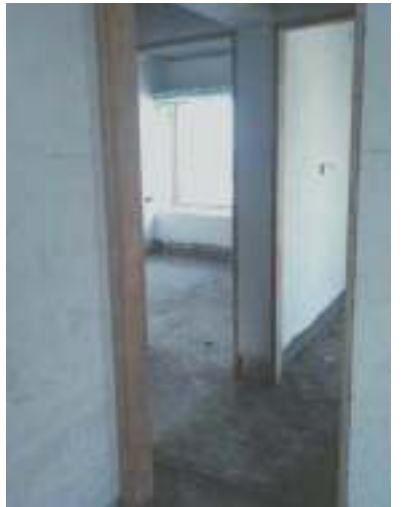
PALLADIO - E - DOOR FRAME FIXING WORK IS IN PROGRESS ON 21 ST FLOOR.