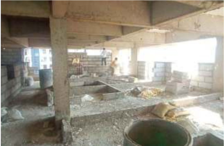
YASH 101 - WING 2 AAC BLOCK WORK AT 3 RD FLOOR WIP.