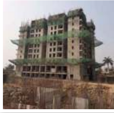
YASHONE MAAN-HINJAWADI - 'E' 10 TH FLOOR SLAB PART-1 CASTING COMPLETED, PART-2 WORK IS IN PROGRESS