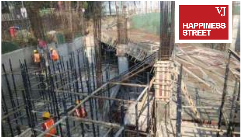
VJ HAPPINESS STREET 1 ST TO 2 ND SLAB RAMP CASTING COMPLETED.