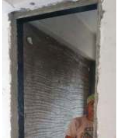
YASHWIN ENCORE - 'B1B2' TOILET DOOR FRAME FIXING WORK IS IN PROGRESS ON 7 TH FLOOR.