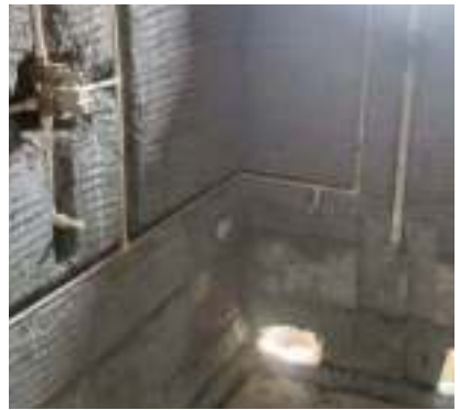
YASHWIN ENCORE - 'B1B2' CPVC WORK IS IN PROGRESS ON 12 TH FLOOR.