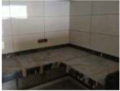
PALLADIO - E - KITCHEN DADO TILE WORK HAS BEEN COMPLETED UPTO 21 ST FLOOR.