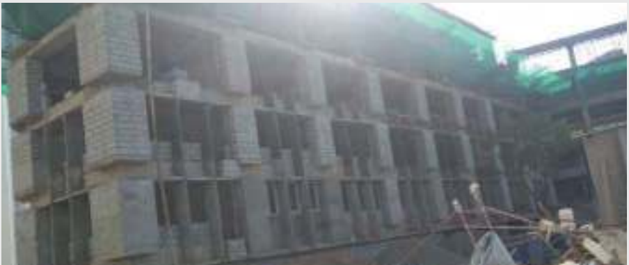
RYAN SCHOOL - ABOVE 5 TH SLAB COLOUMN SHUTTERING WORK IS IN PROGRESS.