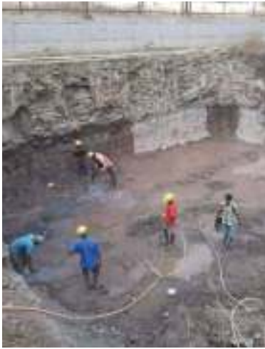
YASHONE MAAN-HINJAWADI - 'C' STP EXCAVATION WORK IS IN PROGRESS.