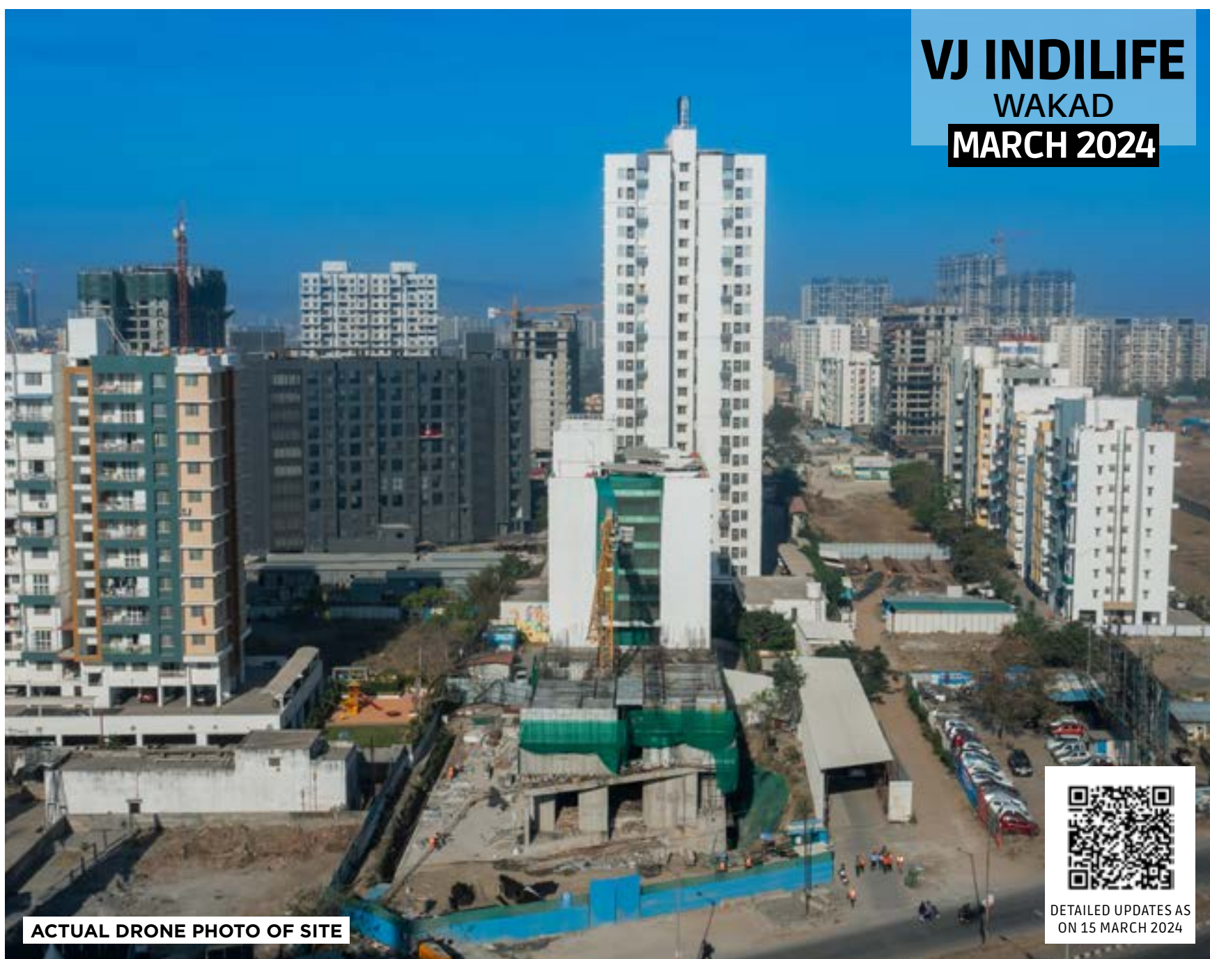
ACTUAL DRONE PHOTO OF SITE