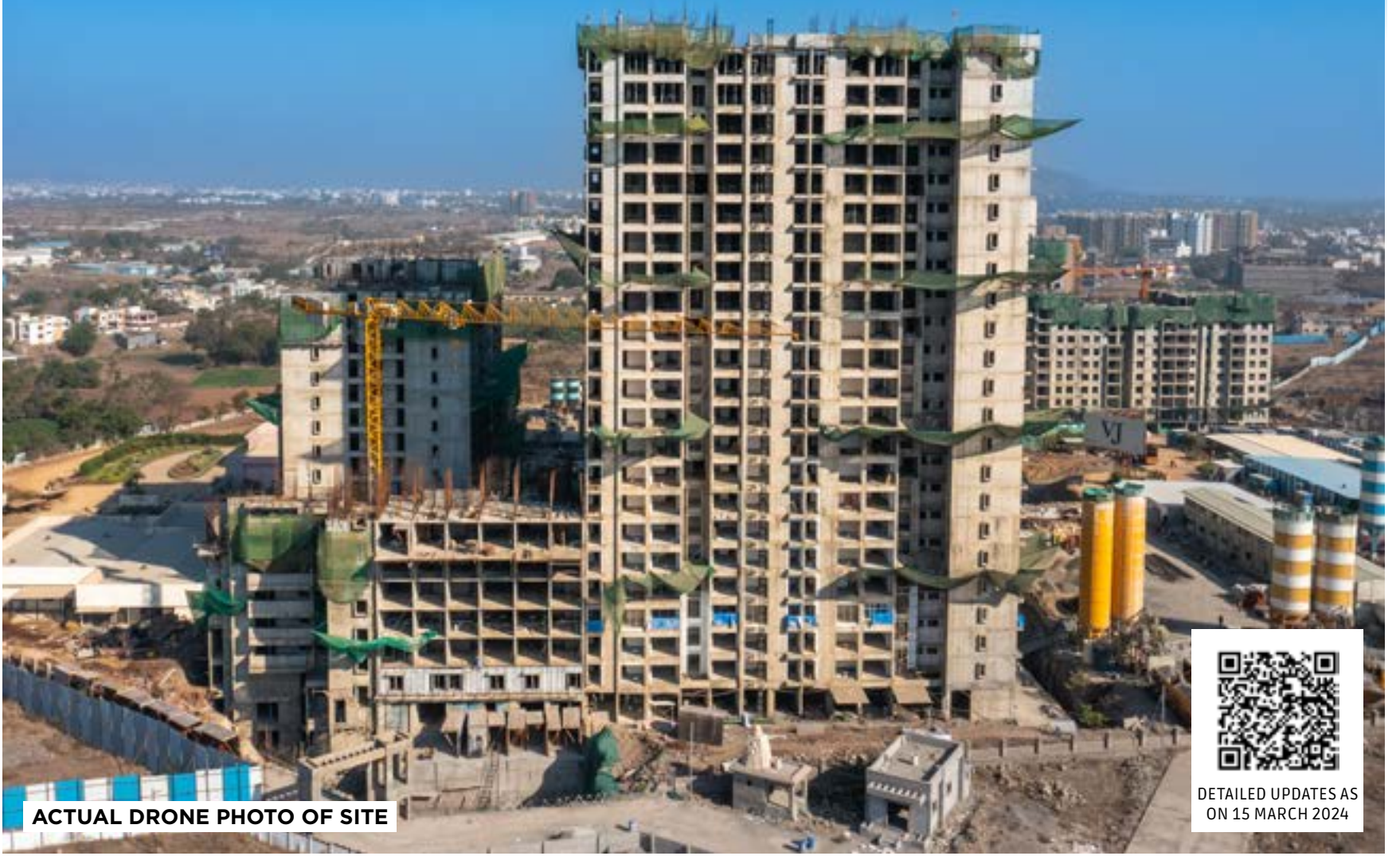
ACTUAL DRONE PHOTO OF SITE