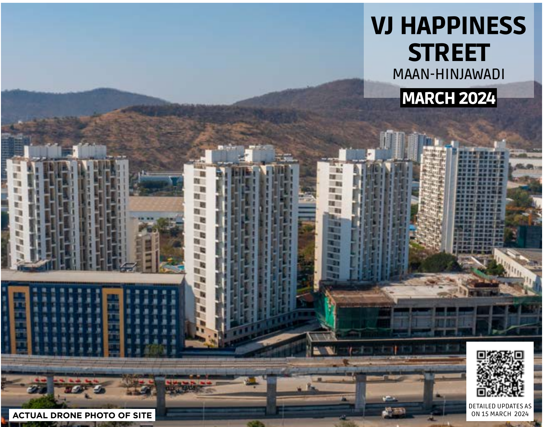
ACTUAL DRONE PHOTO OF SITE