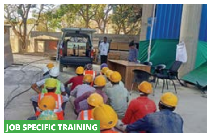
JOB SPECIFIC TRAINING