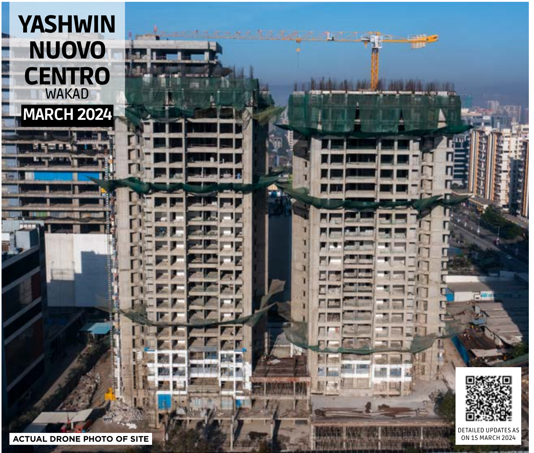
ACTUAL DRONE PHOTO OF SITE