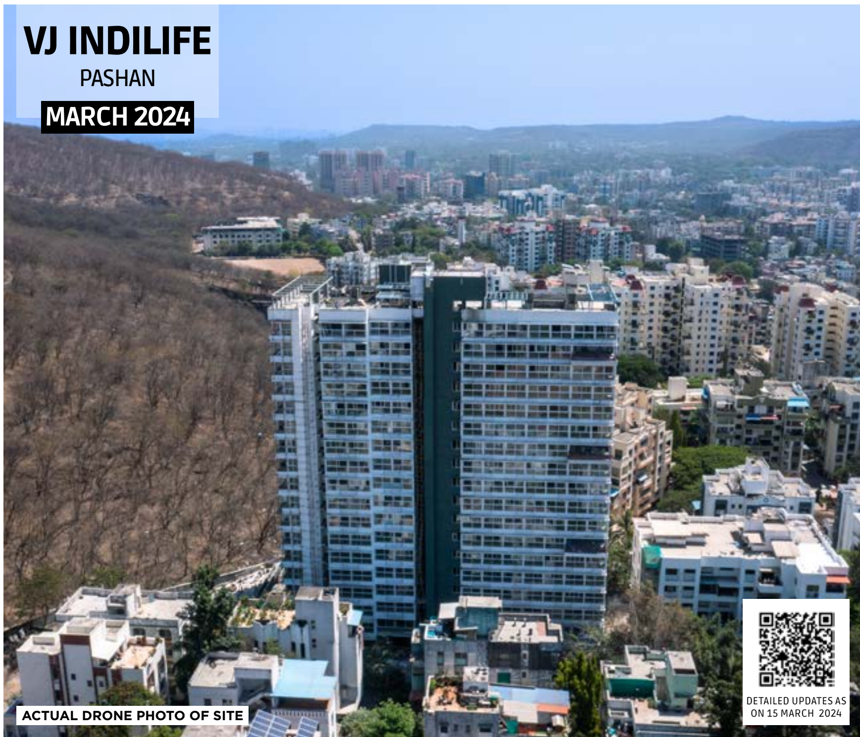
ACTUAL DRONE PHOTO OF SITE