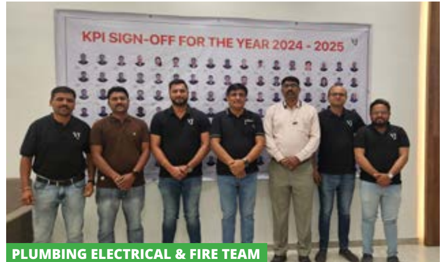
PLUMBING ELECTRICAL & FIRE TEAM