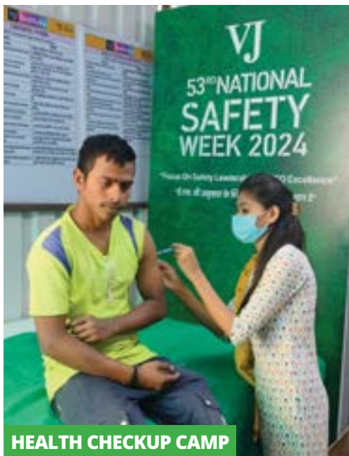
HEALTH CHECKUP CAMP