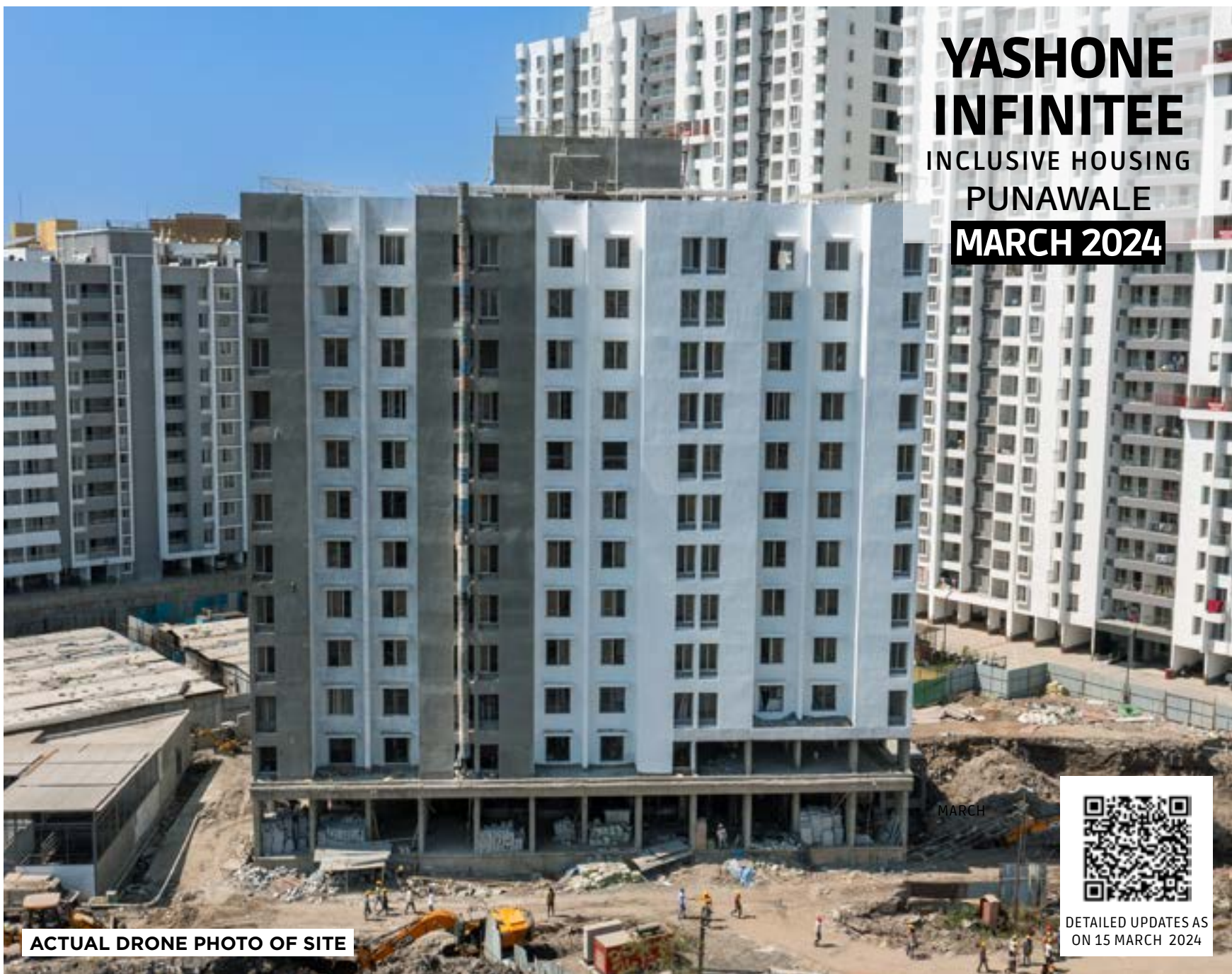
ACTUAL DRONE PHOTO OF SITE