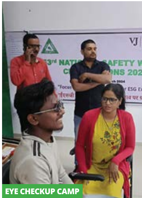
EYE CHECKUP CAMP