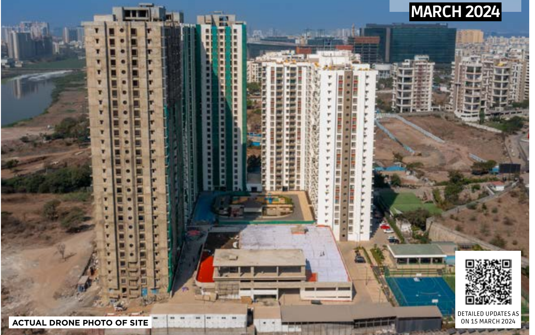
ACTUAL DRONE PHOTO OF SITE