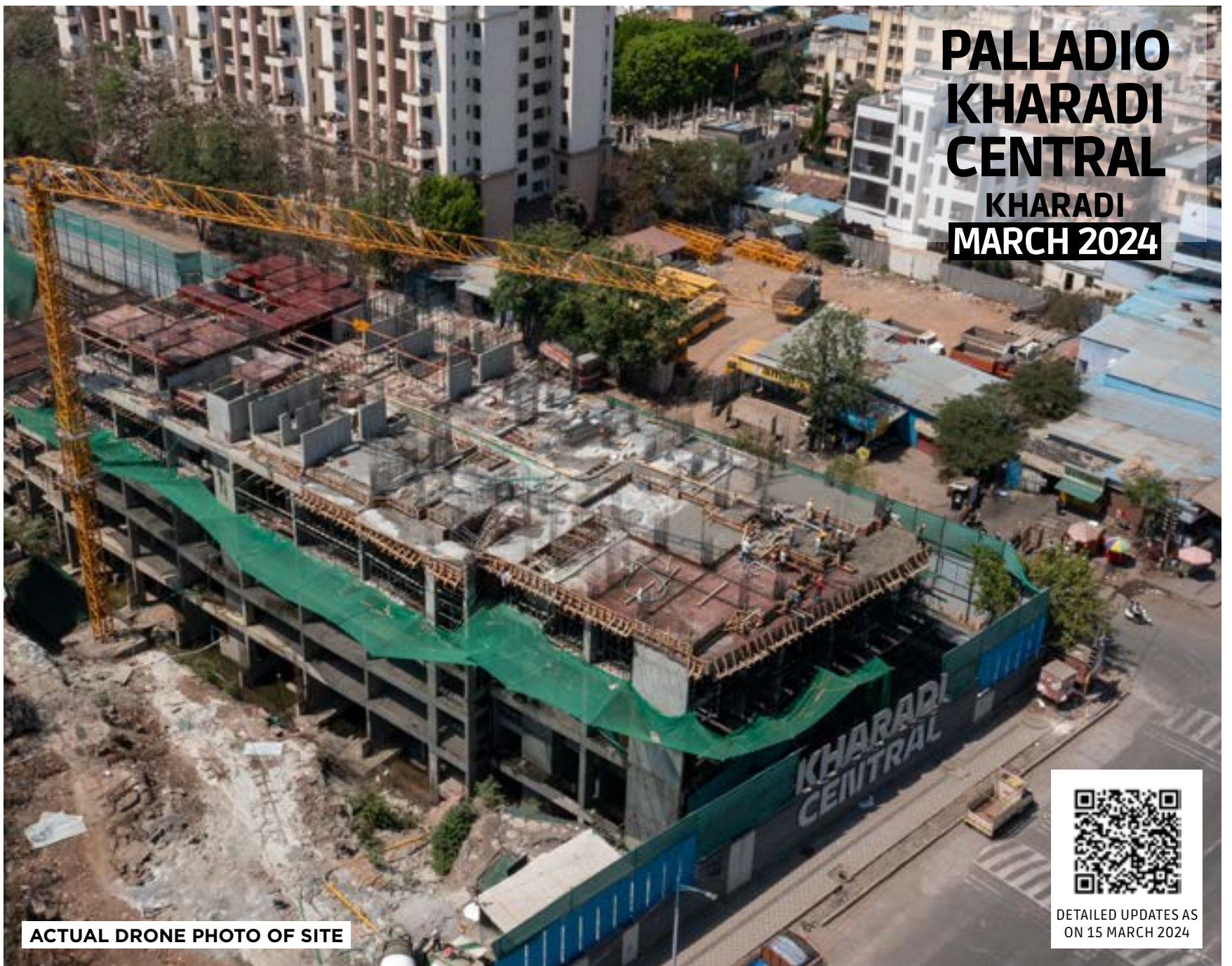
ACTUAL DRONE PHOTO OF SITE