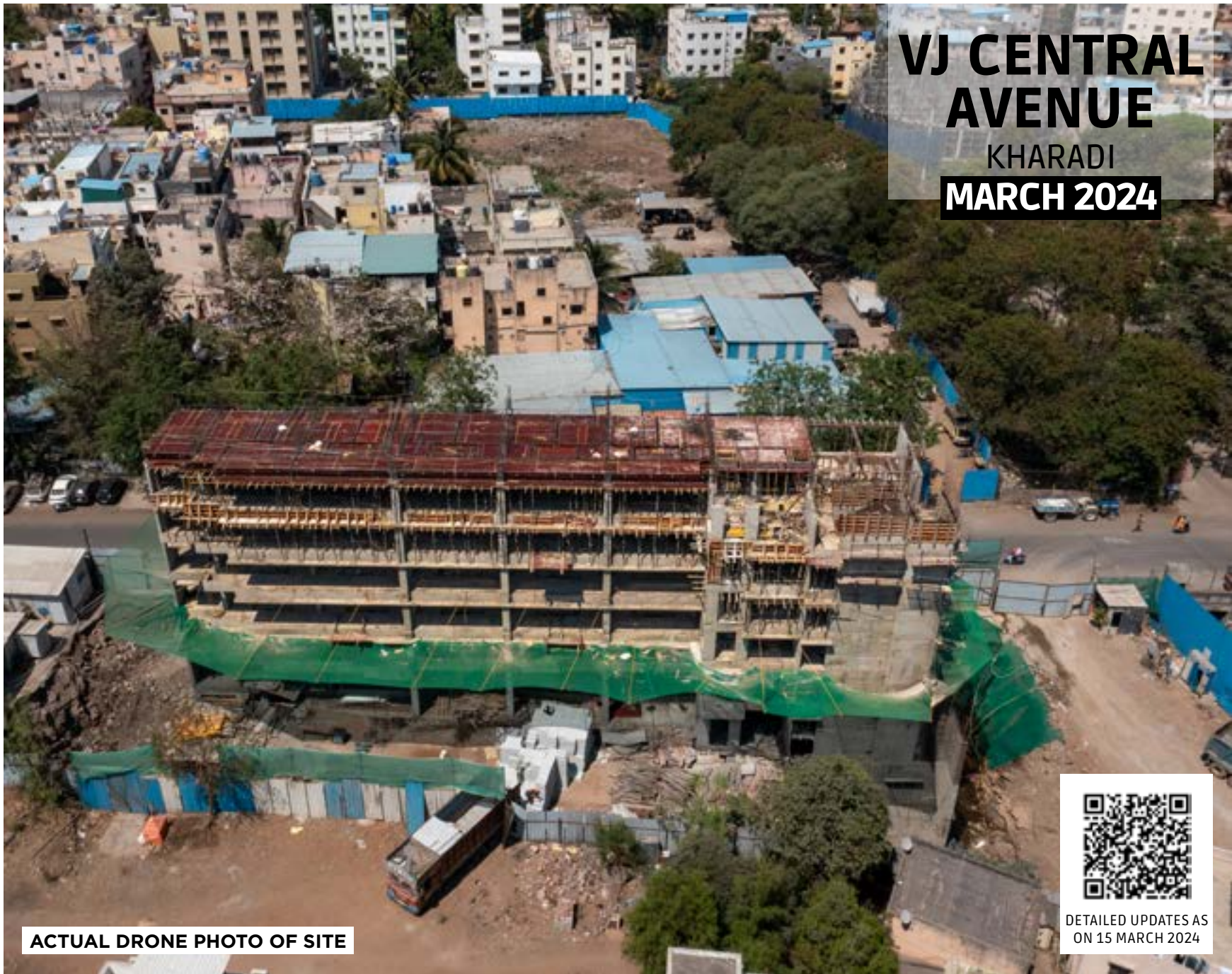
ACTUAL DRONE PHOTO OF SITE