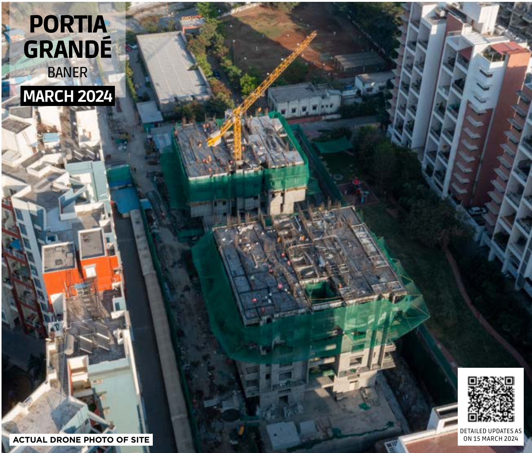
ACTUAL DRONE PHOTO OF SITE