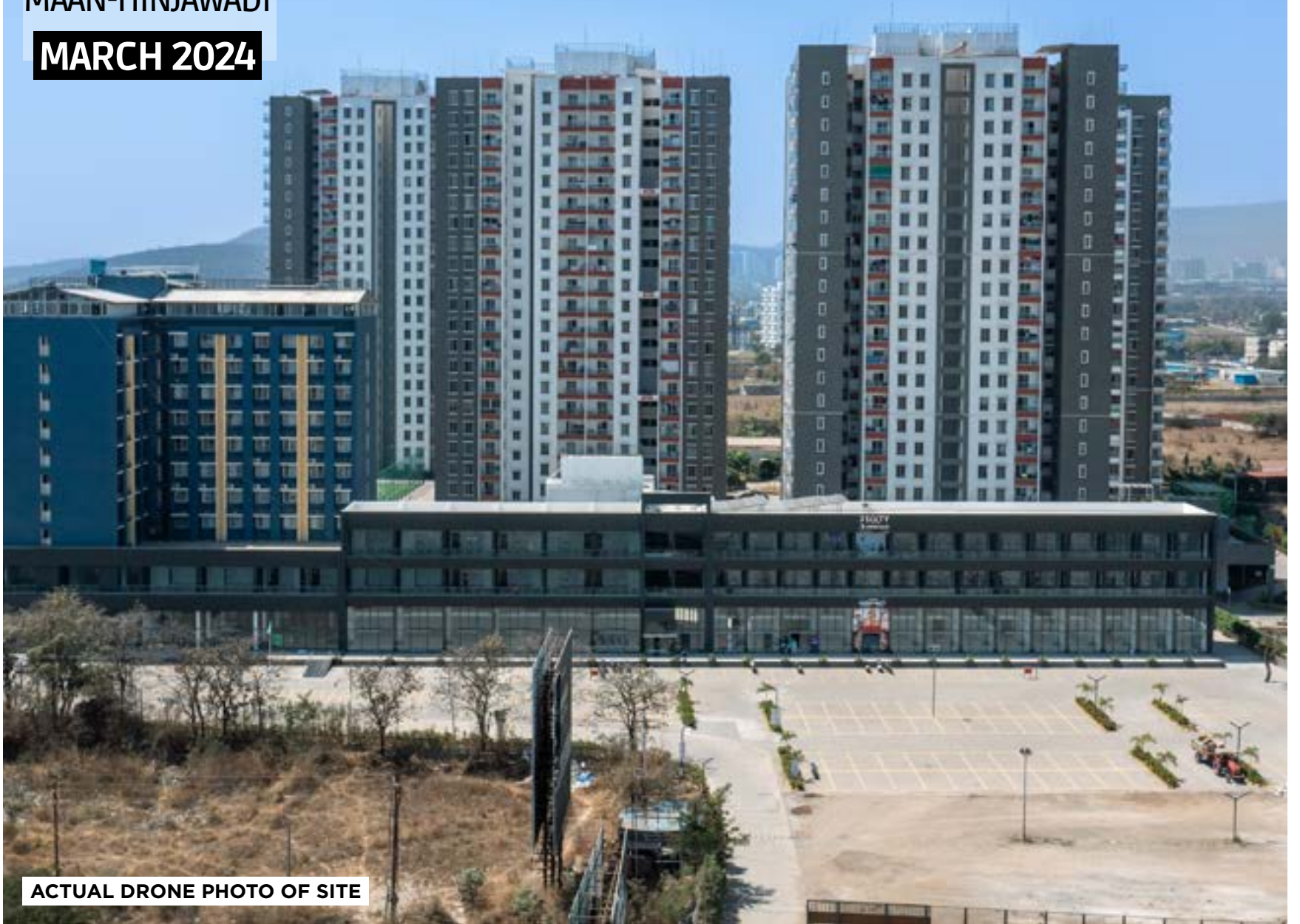
ACTUAL DRONE PHOTO OF SITE