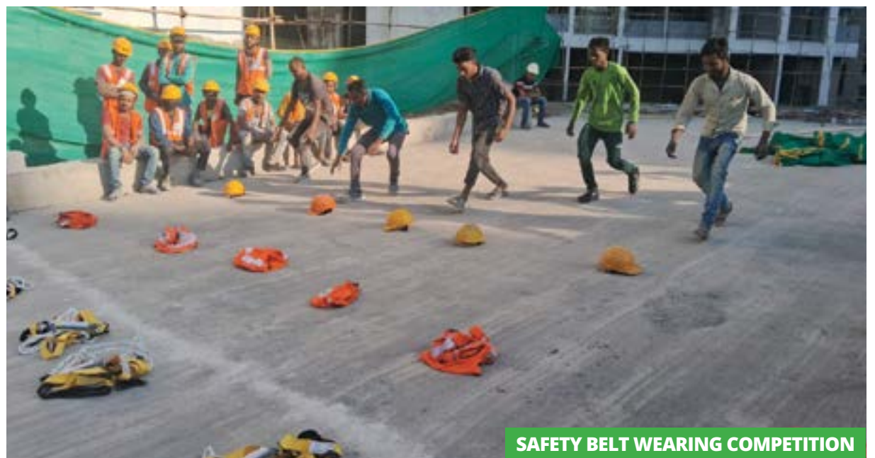
SAFETY BELT WEARING COMPETITION