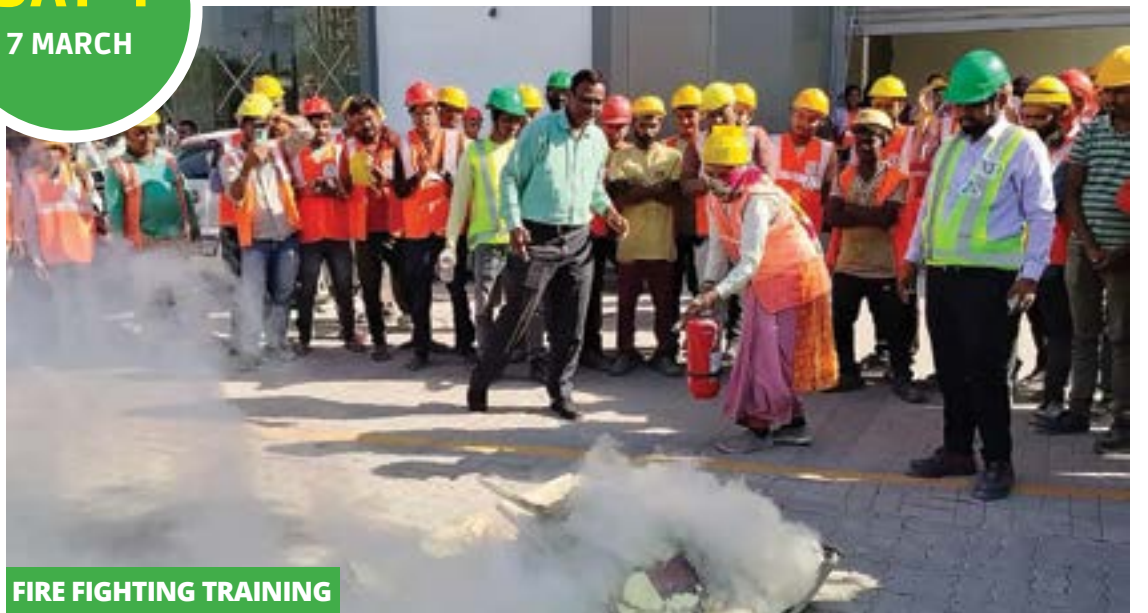
FIRE FIGHTING TRAINING