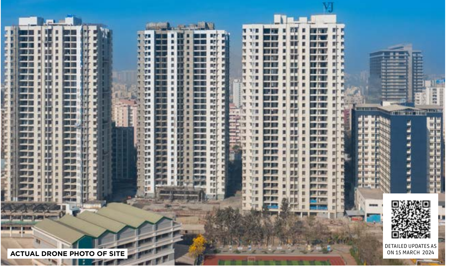
ACTUAL DRONE PHOTO OF SITE