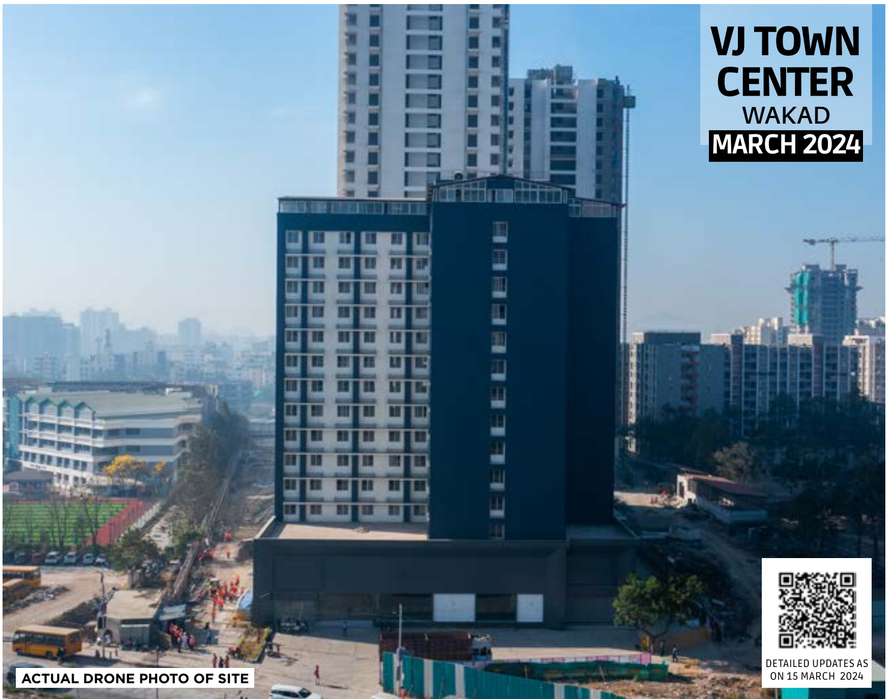
ACTUAL DRONE PHOTO OF SITE