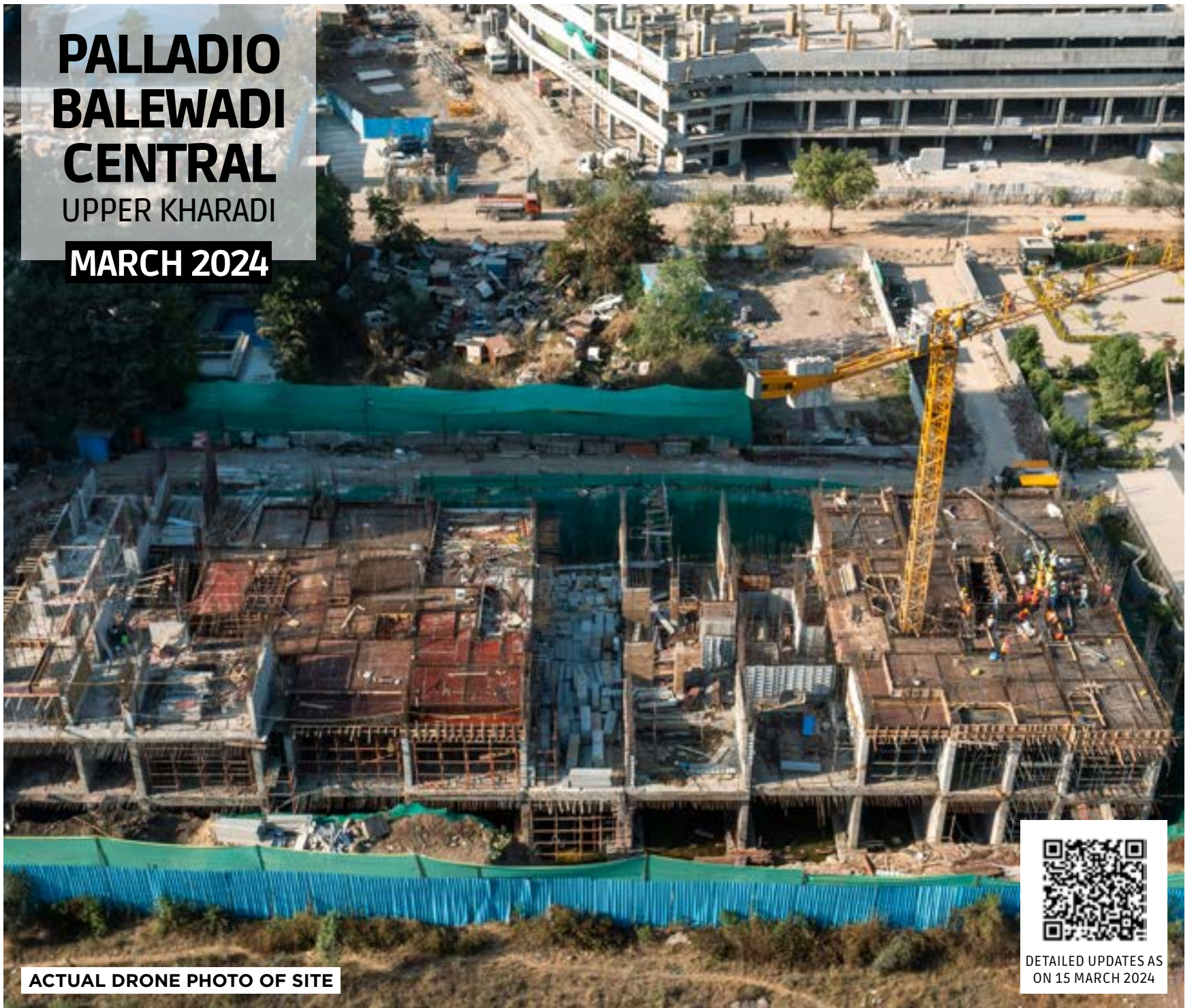
ACTUAL DRONE PHOTO OF SITE