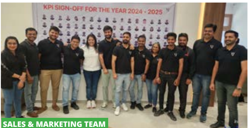
SALES & MARKETING TEAM