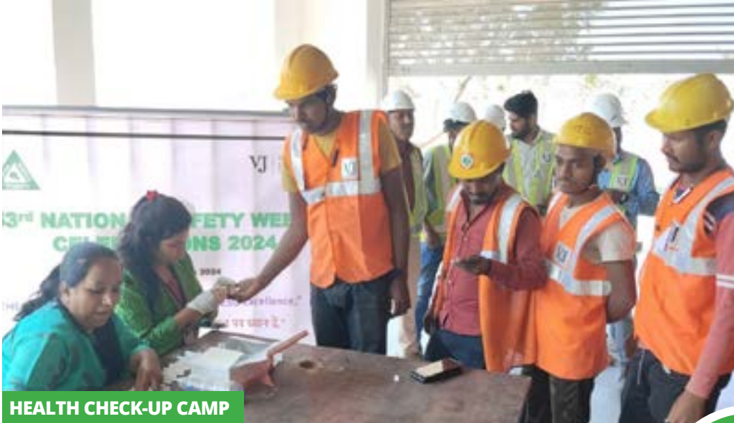
HEALTH CHECK-UP CAMP