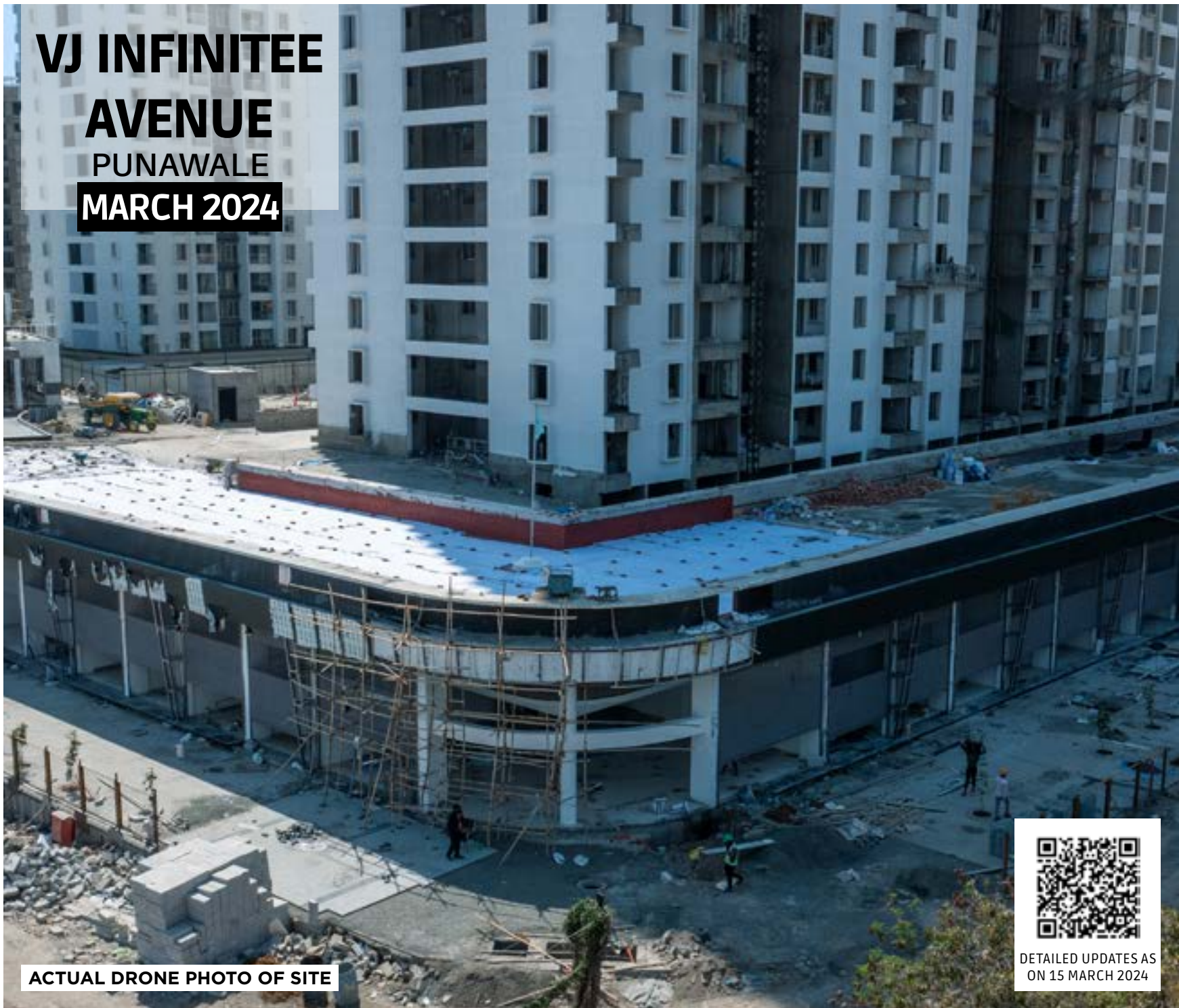
ACTUAL DRONE PHOTO OF SITE