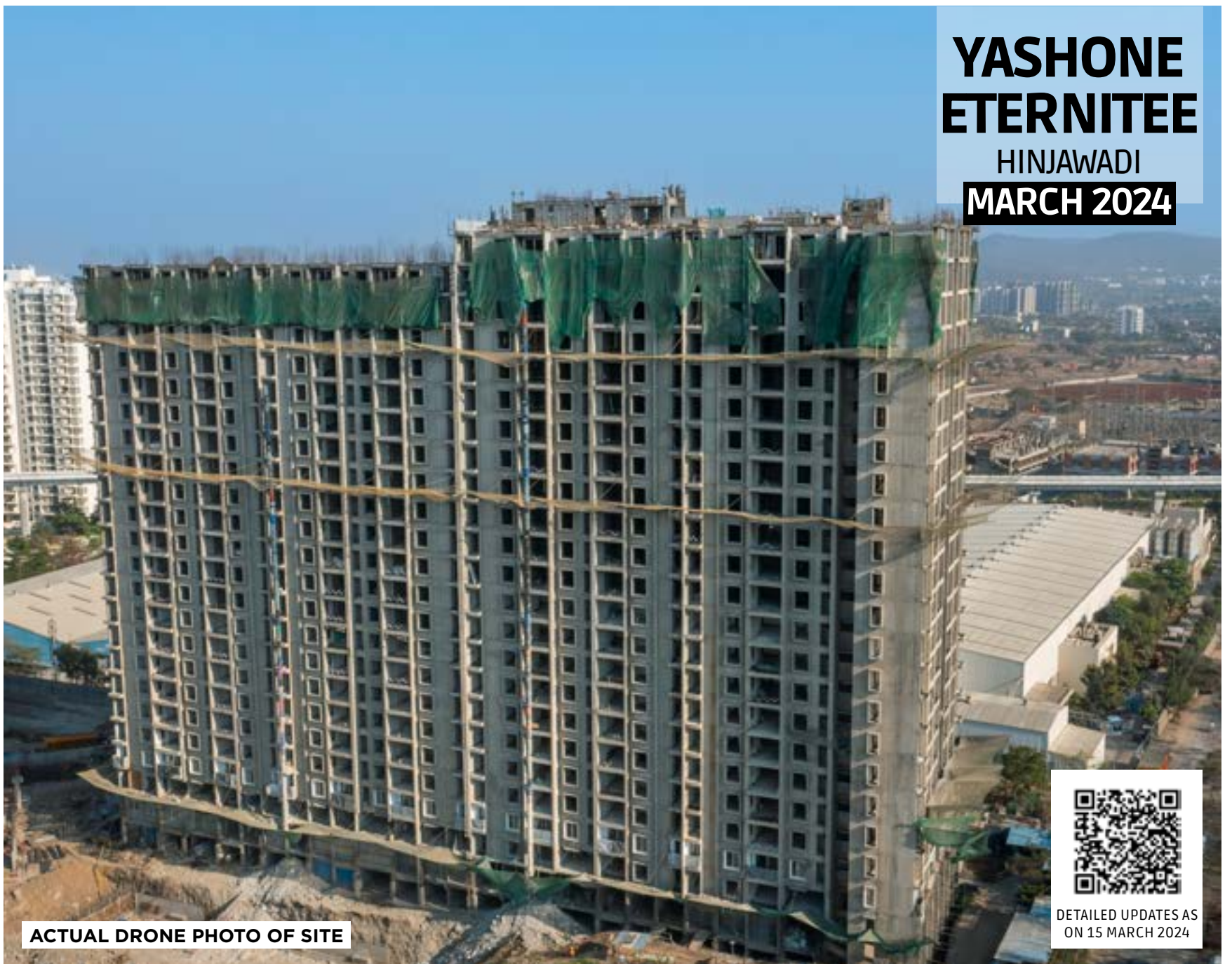
ACTUAL DRONE PHOTO OF SITE