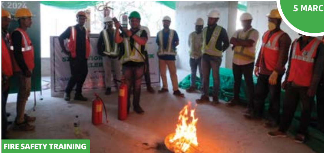
FIRE SAFETY TRAINING