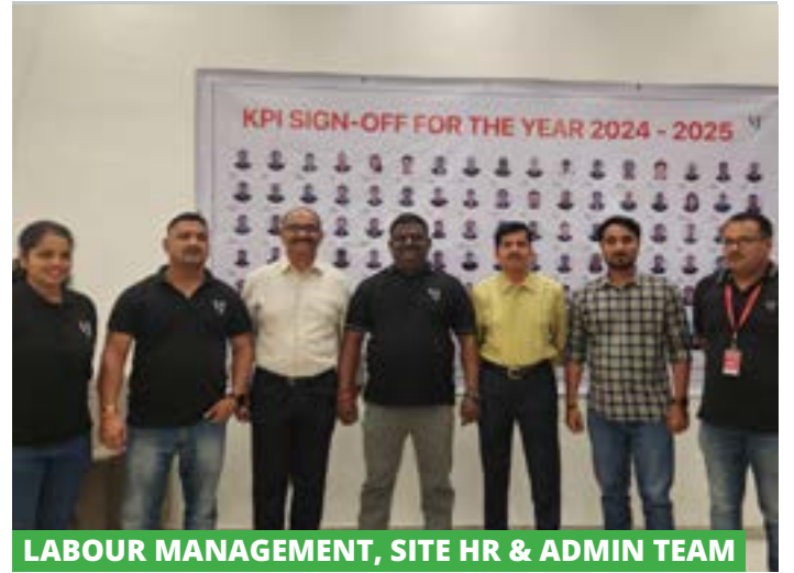
LABOUR MANAGEMENT, SITE HR & ADMIN TEAM