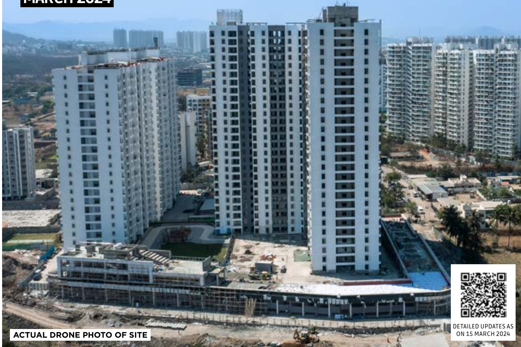
ACTUAL DRONE PHOTO OF SITE