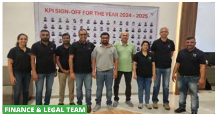
FINANCE & LEGAL TEAM