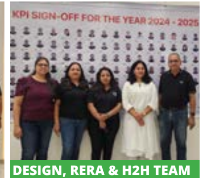
DESIGN, RERA & H2H TEAM